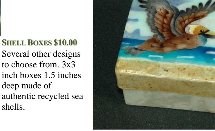
Several other designs to choose from. 3x3 inch boxes 1.5 inches deep made of