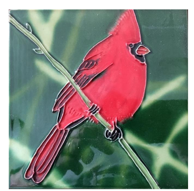
CERAMIC CARDINAL TILE

6x6 inch tile is $14.00 4x4 inch tile is $8.00 2.5x2.5 inch tile Magnet $5.00