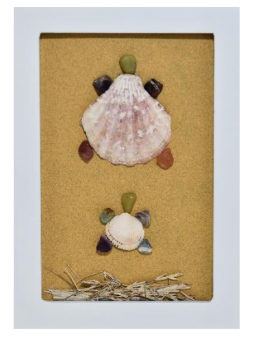
SEA GLASS AND SEASHELL ART BY BARBARA LEO $10.00 each Lots of designs to available

Your support and generosity are always appreciated!