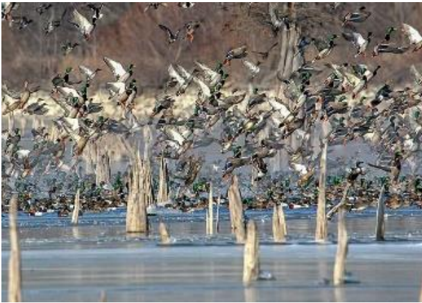
Best Overall, Edward Wall, Lake Ashbaugh, AK