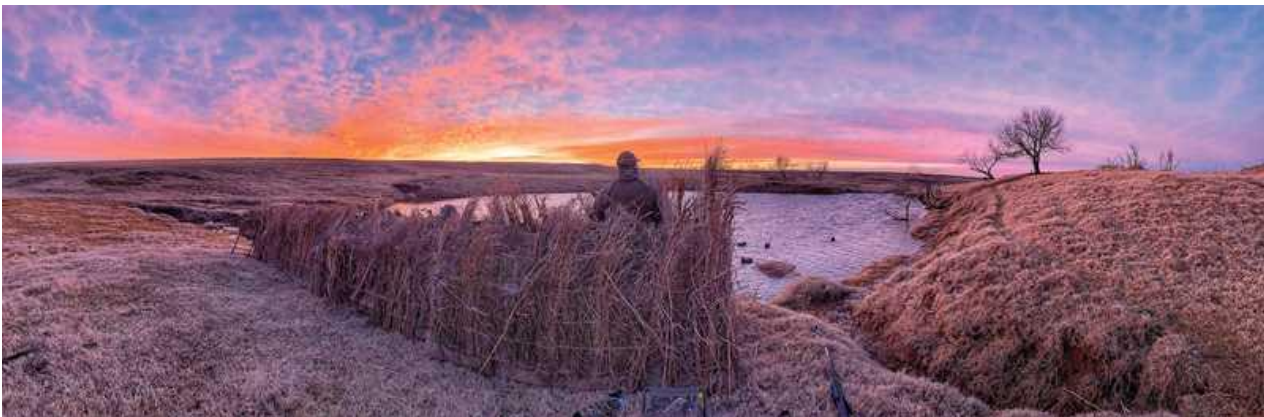
Best Waterfowl Hunting, Justin DeYoung, Groves, TX