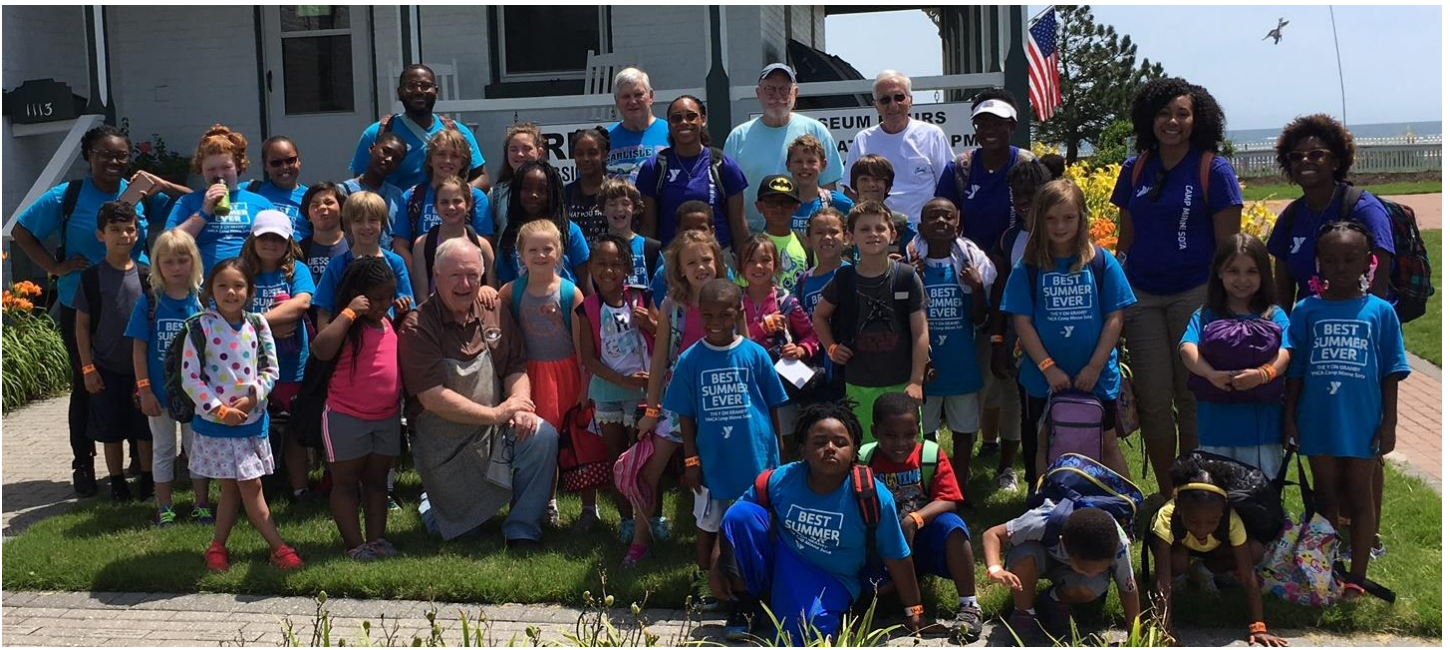
DEWITT COTTAGE GARDENS