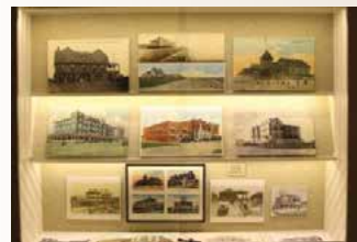
One of Eight new cabinets in the New ETB VB Yesterday Gallery.

Members of the Back Bay Wildfowl Guild can take great pride in what helps the "Gem of the Virginia Beach Oceanfront" sparkle even more brightly.