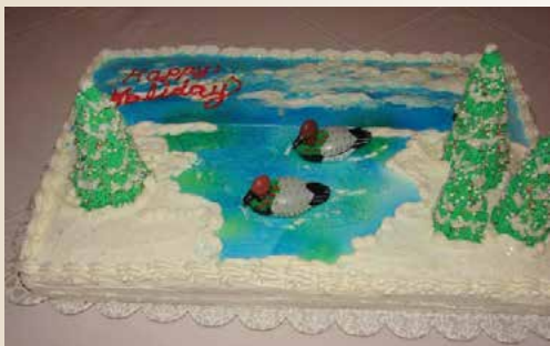
Who made this cake in 2010?

If you have any items/services available for the auction, please bring them by the Museum or contact us with what you are willing to donate. Cash donations are always appreciated and accepted!